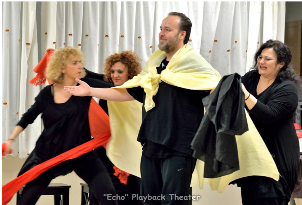
"Echo" Playback Theater